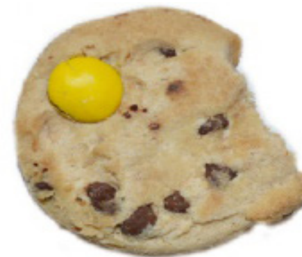
Too Few Gems Broken

Only common examples have been pictured. There are many standard measurements that can be used, individually or combined within formulae, to qualify your product. All visible product characteristics and faults can be quantified.