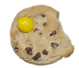
Too Few Gems